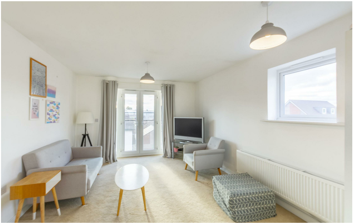
A modern two bedroom top floor apartment.

Situated on the second floor of this small and sought after development sits this stylish and modern two bedroom apartment providing ideal accommodation for a first time buyer, those looking to downsize or investor.